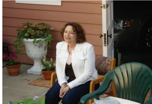
The guest of honor reflects on her eight years as department chair.