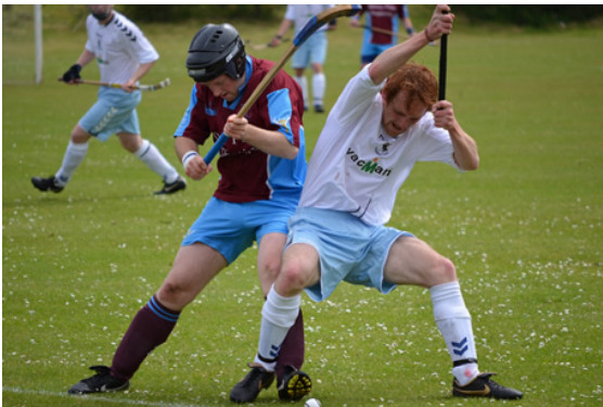
Skye Camanachd versus Lochcarron

In non 'work' hours, we made the most of the cultural, historical and natural treasures Skye and its people have to offer: