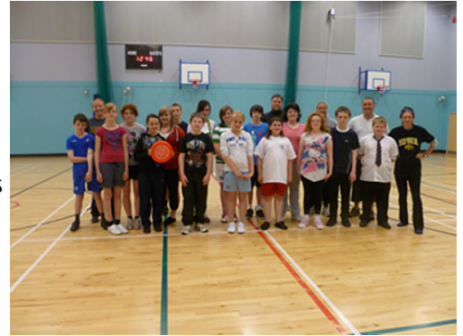
Ultimate Frisbee class at Portree High School