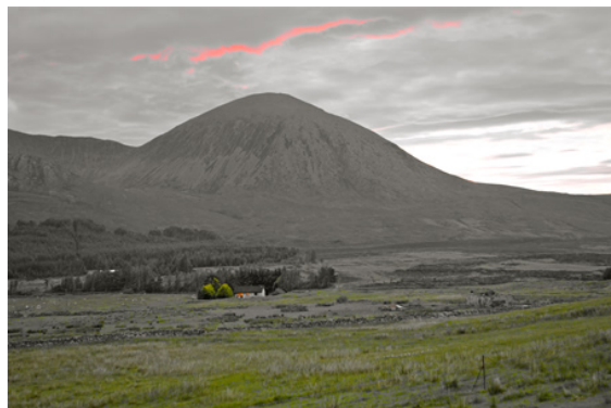
Our home base in Strath Suardal, Skye

We will be presenting another paper on the Sklowaye project at the North American Society for Sport Sociology meeting in November. Plans are also afoot for future research visits to Skye and the continued exploration of sport's transnational and transatlantic resonances.