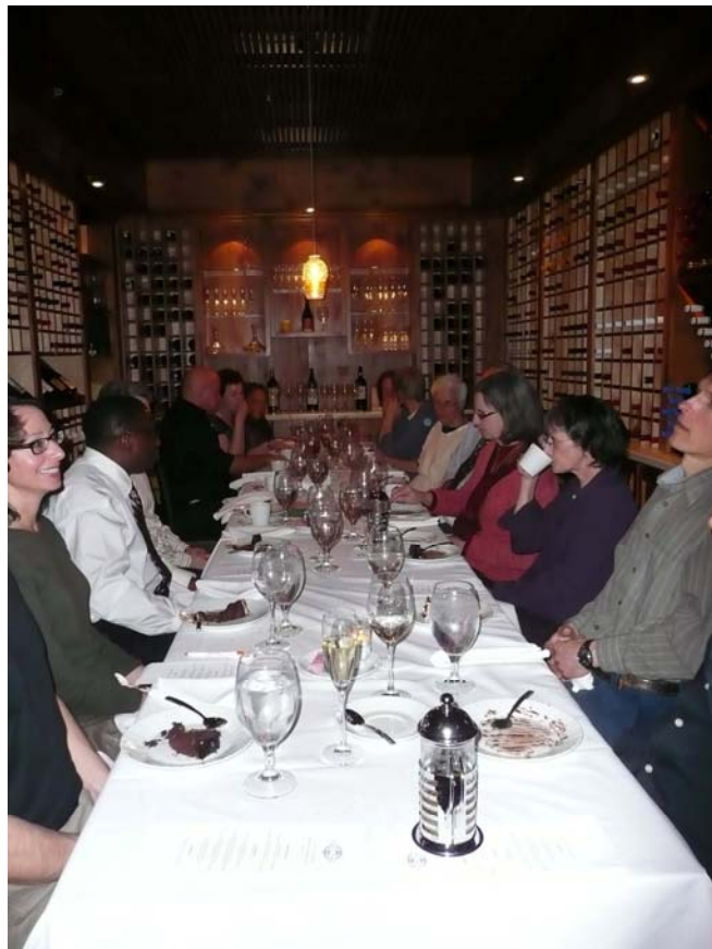
The Wine Room at Chef's Table .